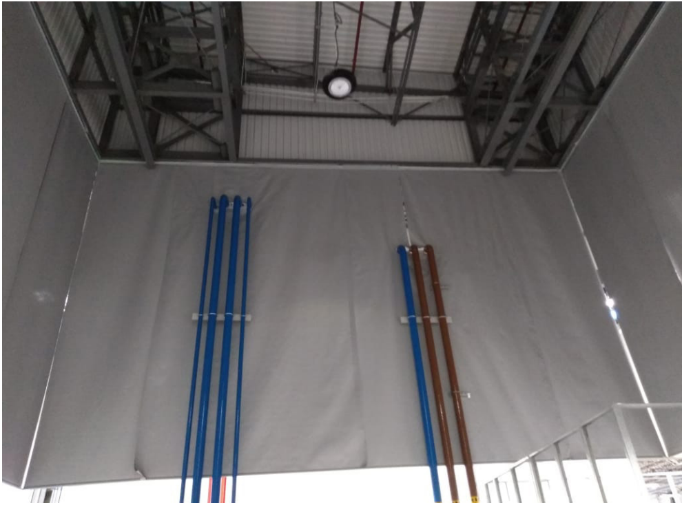
Preforations in curtains